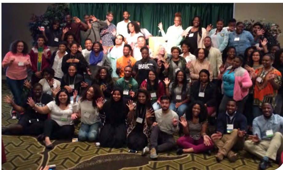
Above: 30 students from Active Advocacy Coalition visited the Missouri Legislature in February, 2016 to deliver critical information about Bright Flight, the state's merit scholarship.