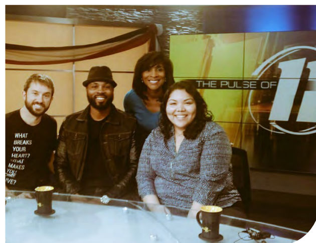
Top: Show Me Democracy characters during panel discussion following premiere screening.

For Show Me Democracy , Speak Up Productions partnered with the nonprofit Continuity, whose mission is to expand diversity in media production. Students edited scenes and assisted with the film’s marketing and distribution. Music for the film was composed by Grammy Award Winning Producer, J.R., aka Courtney Orlando Peebles, of St. Louis. The film and its partners have received support from Missouri Humanities Council with support from the National Endowment for the Humanities, Missouri Arts Council, Regional Arts Council, Volunteer Lawyers and Accountants for the Arts, and the St. Louis Community Foundation . Speak Up Productions also produced the award-winning film What Matters about Parris and his friends trying to live in extreme poverty on $1.25 a day across three continents.